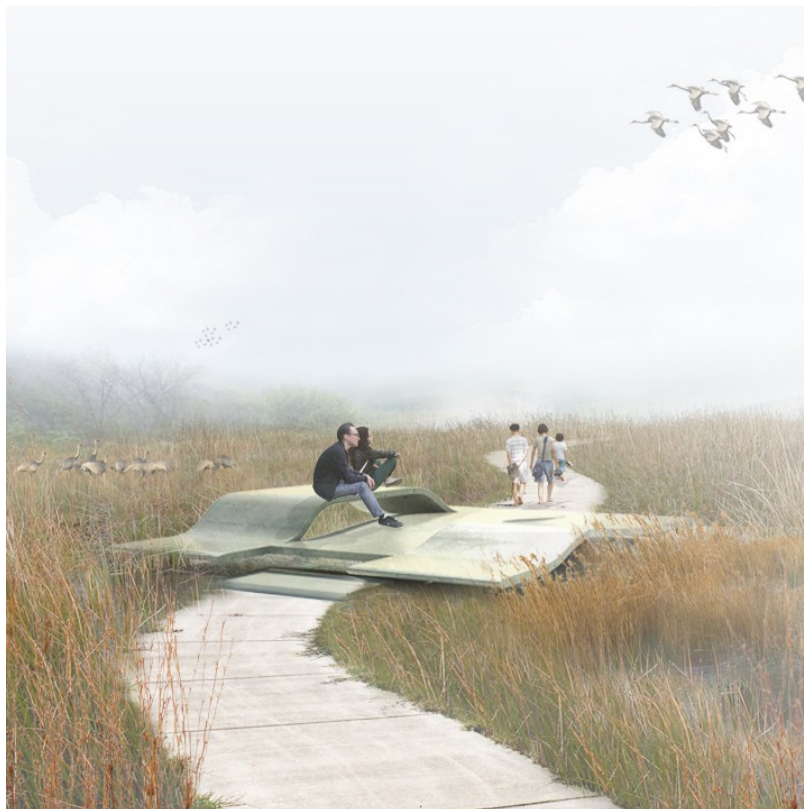
Fig. 9 - Render 1

Due to the nature of the competition being an ideas competition, handrails were omitted in the final images although they were taken into consideration. Polished aluminum balusters and steel wire handrails would be used on the perimeter of the platforms, however for the sake of maintaining the grand parti of the idea we have chosen to omit them in these drawings and renders.