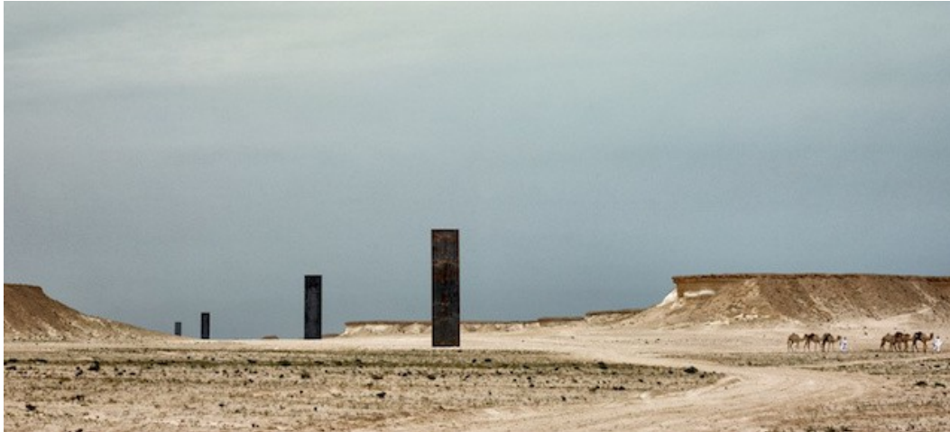
Fig. 4 – Richard Serra 7

By creating a trail that runs across this section of the DMZ, we connect what was the former North Korea to the former South with three individual observation platforms that sit and interact subtly with the landscape. Using the existing barbed fire fence that runs along the entire DMZ as the borders for the nature reserve, the fence is repurposed to mark as the start and end points for the trail. Looking at works from Richard Serra, Fig. 4 , we can take inspiration from how his sculptures in the Qatar desert sit and create a visual connection across the landscape as you walk through it. However, Serra's use of metal would feel too alien in the vibrant and luscious landscape found within the DMZ so a light concrete became the material of choice due to how it compliments nature without blending in, Fig. 5 . Using SANAA's minimalistic approach to design, Fig. 6 , we took inspiration from their Serpentine Pavilion to create three typologies for the observation platforms that were both light and unobtrusive to the surroundings. These platforms sole purpose are to be for observing the landscape.