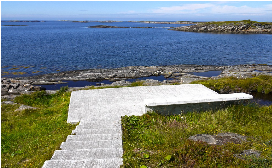
Fig. 5 – Kjeska Viewpoint, Norway 8