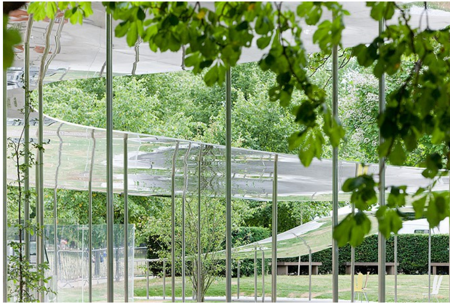
Fig. 6 – Serpentine Pavillion by SANAA 9

The three typologies, Fig. 7 , create three different vantage points in which visitors can stop and look out across the landscape. The first is an elevated platform with a ladder supported on two beams and four columns. This typology is an “information artifact” with writing on the underside that teaches visitors about the history of the area. The second is an extension of the land where the platform thrusts out on a hillside supported by two beams and two columns. The last typology is a slightly elevated platform that sits just a step or two above the ground, supported by two beams. These platforms highlight the landscape and give hikers the chance to pause and reflect upon where they are and what they are seeing by providing a place to sit, lie down, or to stand.