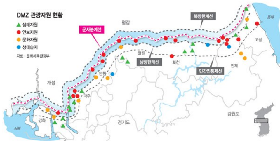
Fig. 1 - DMZ Areas of Protection 4 Green - Environmental Red - Wildlife Yellow - Cultural Blue - Water

The Korean demilitarized zone is recognized as one of the most well preserved areas in the world home to over 3,000 species of plants and animals, with at least 67 of the worlds most endangered animals 3 including the red crowned crane, white naped crane, Asian black bear, amur leopard, and the Korean tiger. The zone owes its immense biodiversity to the geography of the land, as the zone crosses mountains, prairies, swamps, and lakes from coast to coast. Due to the dangers that the demilitarized zone poses in regards to landmines, the ability to completely reclaim the land back for human use is next to impossible. However, due to the rarity of such a preserved landscape, our proposed vision for the future of this area aims to preserve the majority of the zone as a wildlife refuge by maintaining the area as a national park. As seen in Fig. 1 , there are key areas along the border that should be protected in terms of the environment, wildlife, culture, and water.