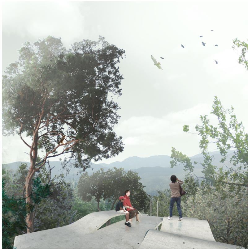
Fig. 10 – Render 2

“Changing consciousness through architecture is possible. Sharing and inhabiting a common space means as much as sharing the same ideology and philosophy of life. Can architecture claim its own powerful sense of ownership to peacefully resolve the conflicts of ideology and religion?” 10